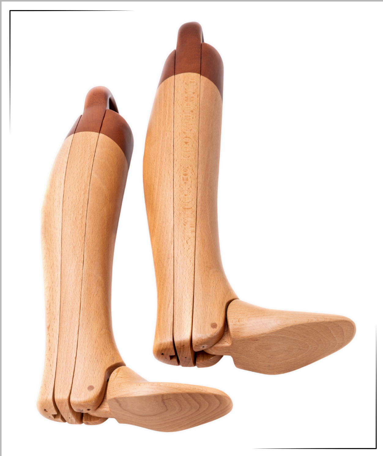
—❧— Tendistivale in tre pezzi. Boot stretcher in three parts. —❧—