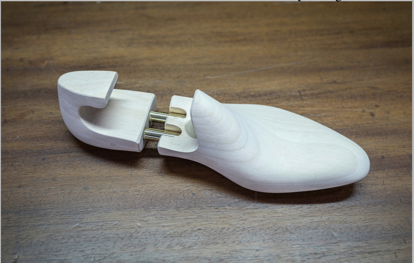
Tendiscarpe con anello e aletta copritubo Shoe trees with ring and hose cover