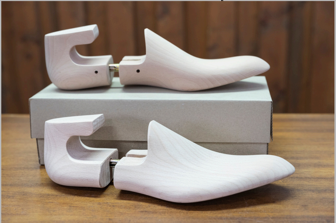
Tendiscarpe con manico e aletta copritubo Shoe trees with handle and hose cover