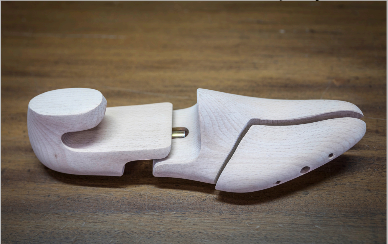
Tendiscarpe con clavetta e tubo a vista Shoe tree with small club and open tube