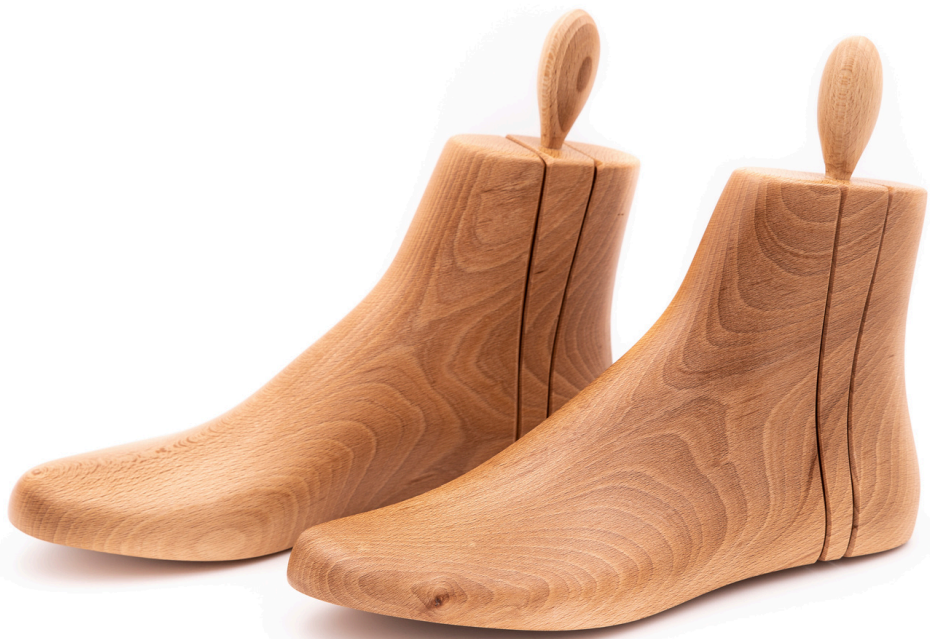
Tendiscarpe in tre pezzi a gambaleto (per stivaletti) Shoe trees in three parts (for boots)