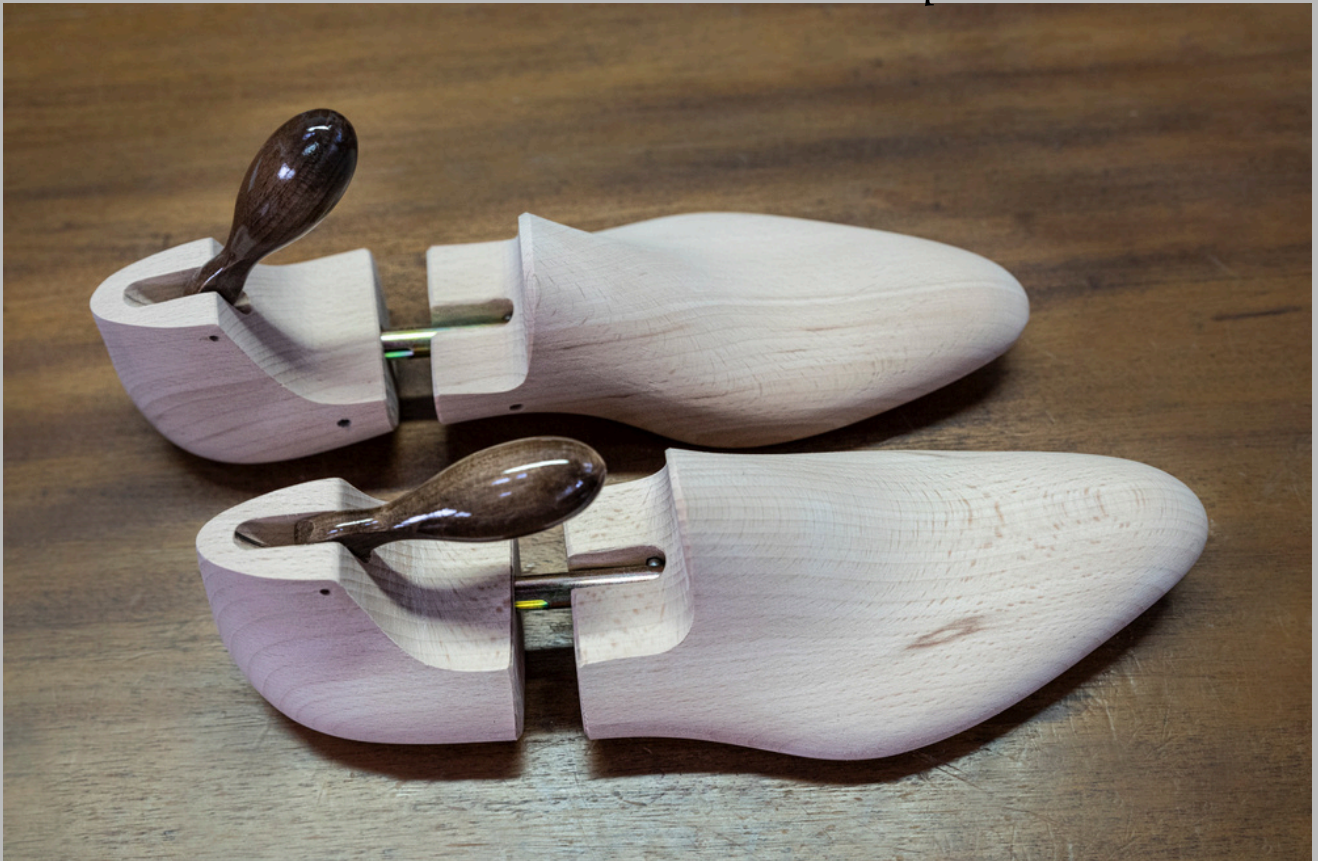
Tendiscarpe con pomello e cerniera Hinged shoe trees with snob